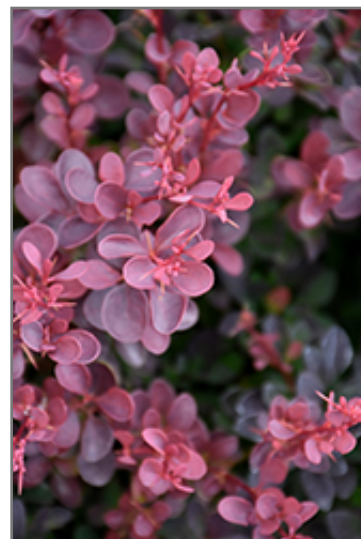
Royal Burgundy Japanese Barberry foliage

Royal Burgundy Japanese Barberry is a dense multi-stemmed deciduous shrub with a mounded form. It lends an extremely fine and delicate texture to the landscape composition which should be used to full effect.