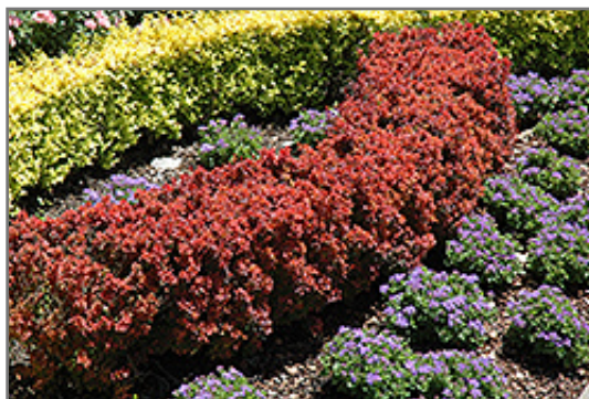
Royal Burgundy Japanese Barberry