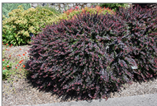
Royal Burgundy Japanese Barberry