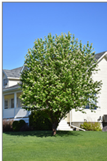
Amur Cherry