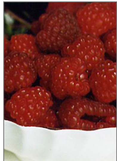
Red River Raspberry fruit

Red River Raspberry has rich green deciduous foliage on a plant with an upright spreading habit of growth. The fuzzy oval compound leaves do not develop any appreciable fall colour. It features an abundance of magnificent red berries in early fall.