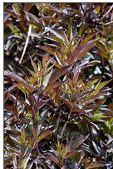
Black Beauty Elder foliage

Black Beauty Elder is recommended for the following landscape applications;