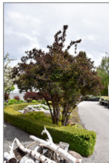
Black Beauty Elder