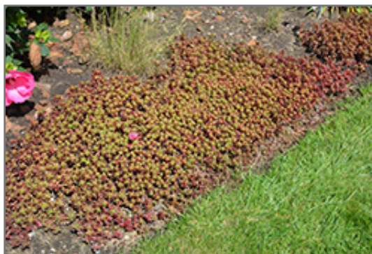
Fulda Glow Stonecrop