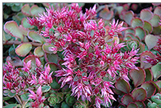
Fulda Glow Stonecrop flowers