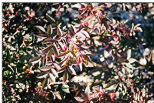
Red Leaf Shrub Rose foliage

This shrub should only be grown in full sunlight. It does best in average to evenly moist conditions, but will not tolerate standing water. It is not particular as to soil type or pH. It is highly tolerant of urban pollution and will even thrive in inner city environments. This species is not originally from North America.