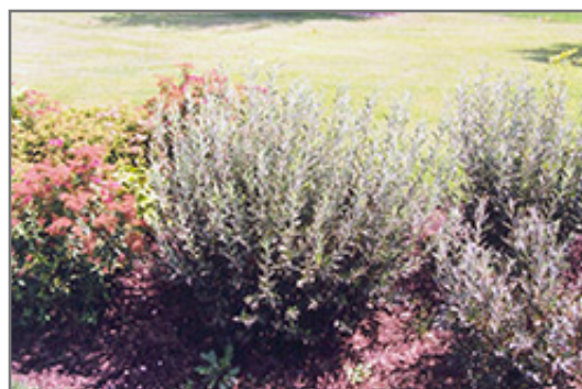
Blue Fox Willow

Blue Fox Willow will grow to be about 4 feet tall at maturity, with a spread of 4 feet. It tends to fill out right to the ground and therefore doesn't necessarily require facer plants in front. It grows at a medium rate, and under ideal conditions can be expected to live for approximately 30 years.