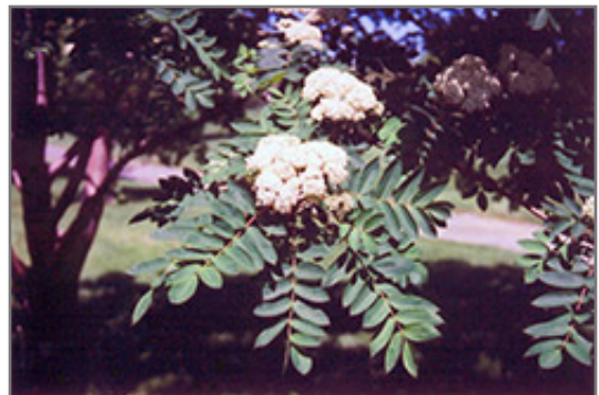
Showy Mountain Ash flowers

This tree should only be grown in full sunlight. It is very adaptable to both dry and moist locations, and should do just fine under average home landscape conditions. It is not particular as to soil type or pH. It is highly tolerant of urban pollution and will even thrive in inner city environments. This species is native to parts of North America.