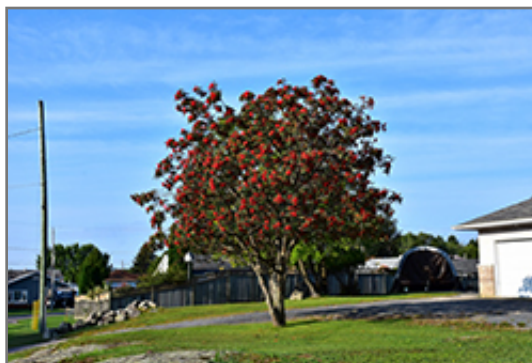
Showy Mountain Ash fruit

Showy Mountain Ash is recommended for the following landscape applications;