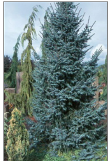
Bruns Serbian Spruce