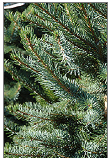
Bruns Serbian Spruce foliage