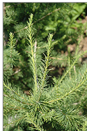
Oasis Siberian Larch foliage