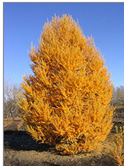
Oasis Siberian Larch in fall