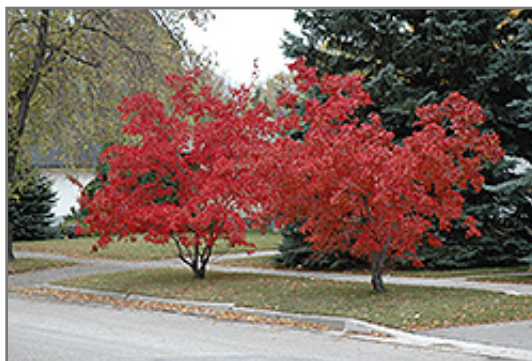
Flame Amur Maple in fall