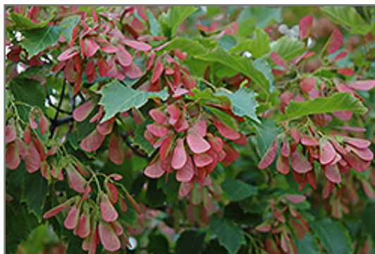
Flame Amur Maple fruit