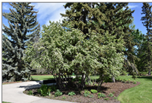
Thiessen Saskatoon

Thiessen Saskatoon is clothed in stunning clusters of white flowers rising above the foliage from early to mid spring before the leaves. It has dark green deciduous foliage. The oval leaves turn an outstanding yellow in the fall. It features an abundance of magnificent blue berries in late spring.