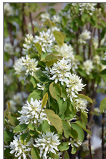
Thiessen Saskatoon flowers