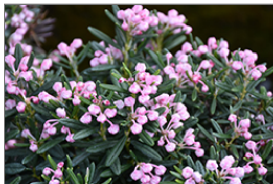
Blue Ice Bog Rosemary flowers