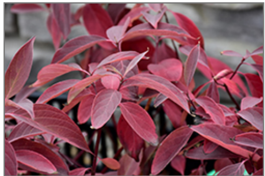
Arctic Fire Red Twig Dogwood in fall

This shrub does best in full sun to partial shade. It is an amazingly adaptable plant, tolerating both dry conditions and even some standing water. It is not particular as to soil type or pH. It is highly tolerant of urban pollution and will even thrive in inner city environments. This is a selection of a native North American species.