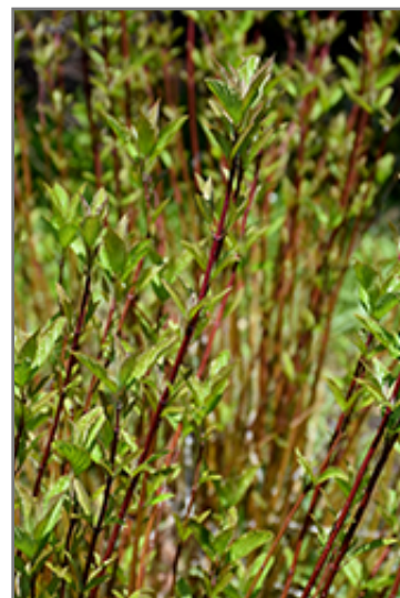
Arctic Fire Red Twig Dogwood stems

Arctic Fire Red Twig Dogwood is recommended for the following landscape applications;