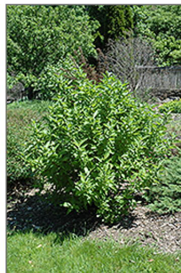
Arctic Fire Red Twig Dogwood