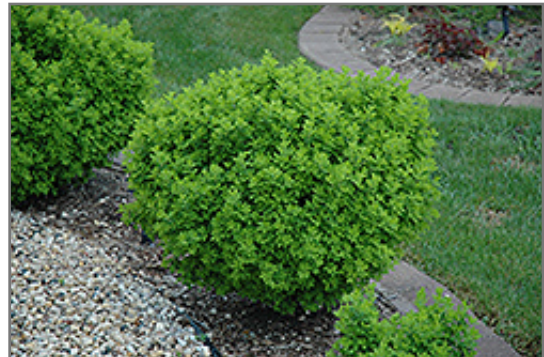
Globe Caragana

Globe Caragana will grow to be about 3 feet tall at maturity, with a spread of 3 feet. It tends to fill out right to the ground and therefore doesn't necessarily require facer plants in front. It grows at a slow rate, and under ideal conditions can be expected to live for approximately 20 years.