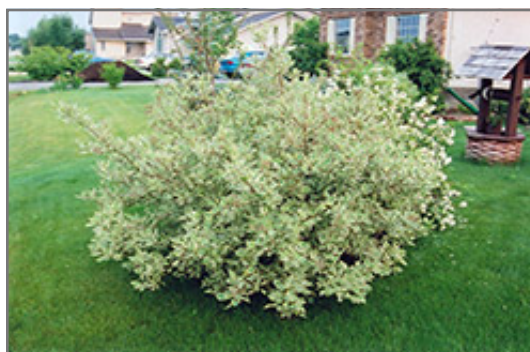
Elegantissima Dogwood

Elegantissima Dogwood is recommended for the following landscape applications;