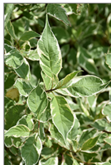
Elegantissima Dogwood foliage