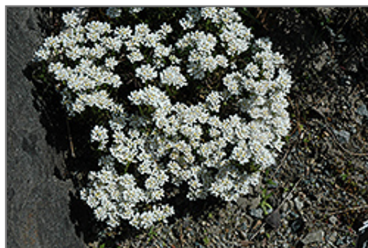
Snowflake Candytuft in bloom