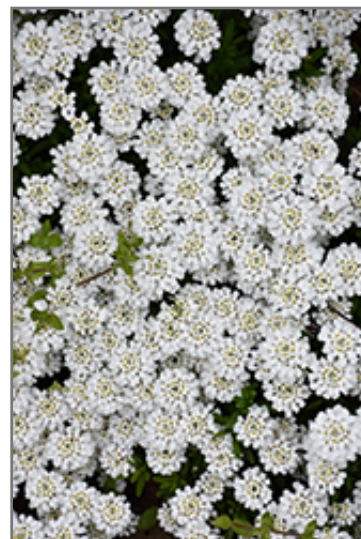
Snowflake Candytuft flowers

Snowflake Candytuft is recommended for the following landscape applications;