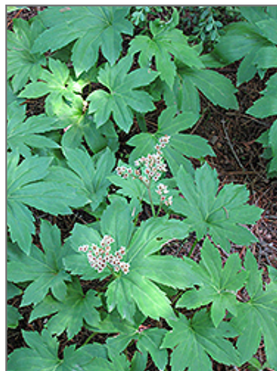
Crimson Fans Mukdenia flowers

This plant is not reliably hardy in our region, and certain restrictions may apply; contact the store for more information.