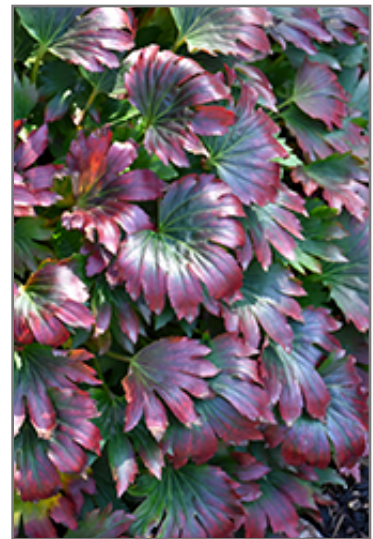
Crimson Fans Mukdenia foliage

Crimson Fans Mukdenia is an herbaceous perennial with tall flower stalks held atop a low mound of foliage. Its relatively coarse texture can be used to stand it apart from other garden plants with finer foliage.