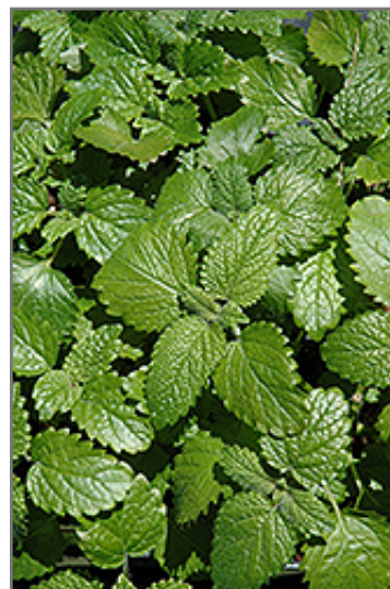
Lemon Balm foliage

Lemon Balm's attractive fragrant pointy leaves emerge light green in spring, turning green in colour throughout the season on a plant with an upright spreading habit of growth. It features dainty lightly-scented white flowers along the stems in late summer.