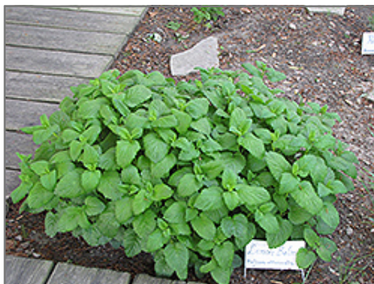
Lemon Balm