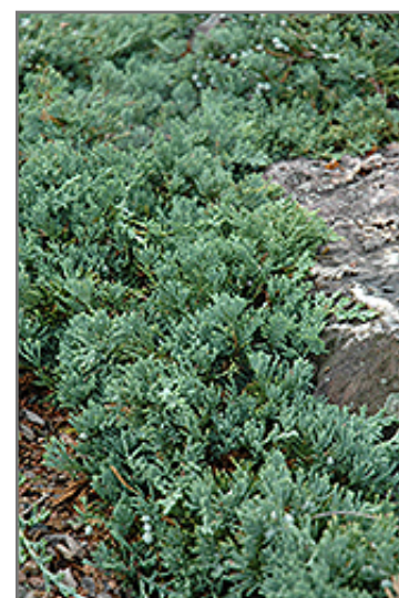
Blue Rug Juniper foliage