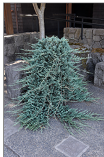
Blue Rug Juniper

This is a relatively low maintenance shrub, and is best pruned in late winter once the threat of extreme cold has passed. Deer don't particularly care for this plant and will usually leave it alone in favor of tastier treats. It has no significant negative characteristics.