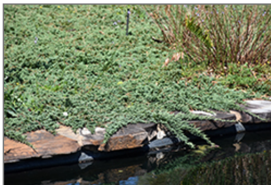
Blue Rug Juniper

This shrub does best in full sun to partial shade. It is very adaptable to both dry and moist growing conditions, but will not tolerate any standing water. It is considered to be drought-tolerant, and thus makes an ideal choice for a low-water garden or xeriscape application. It is not particular as to soil type or pH. It is highly tolerant of urban pollution and will even thrive in inner city environments. This is a selection of a native North American species.