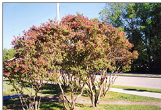
Arnold Red Honeysuckle in bloom