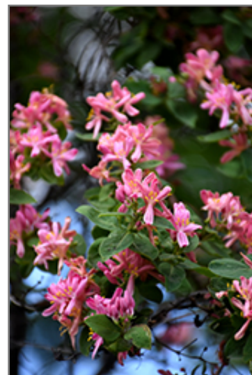
Arnold Red Honeysuckle flowers

Arnold Red Honeysuckle is recommended for the following landscape applications;