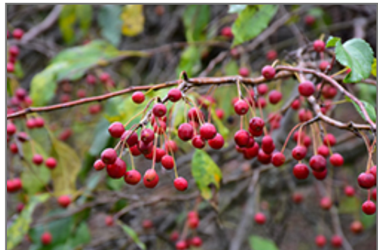
Red Jade Flowering Crab fruit