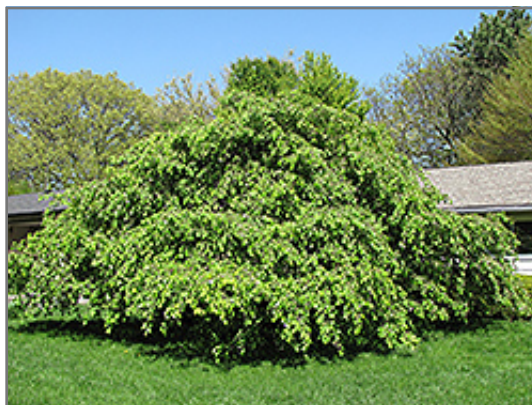
Red Jade Flowering Crab

This tree should only be grown in full sunlight. It prefers to grow in average to moist conditions, and shouldn't be allowed to dry out. It is not particular as to soil type or pH. It is highly tolerant of urban pollution and will even thrive in inner city environments. This particular variety is an interspecific hybrid.