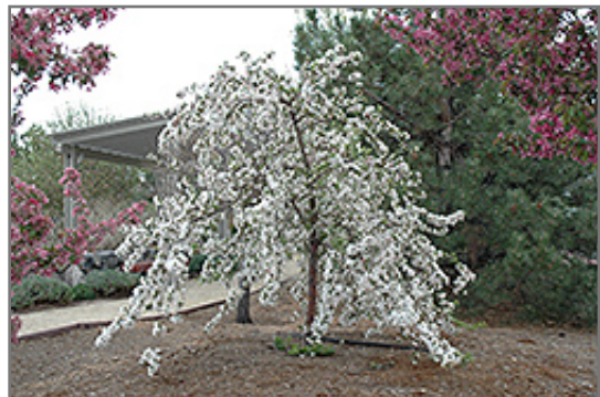
Red Jade Flowering Crab in bloom

Red Jade Flowering Crab is a deciduous tree with a strong central leader and a rounded form and gracefully weeping branches. Its average texture blends into the landscape, but can be balanced by one or two finer or coarser trees or shrubs for an effective composition.